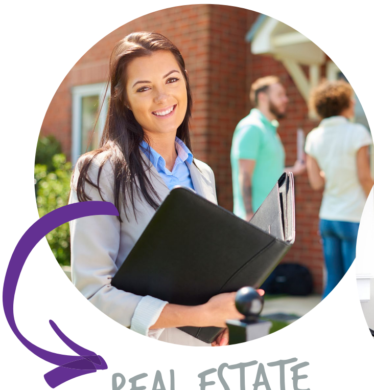
REAL ESTATE AGENT

Remember, though, that your team starts and ends with you. Make sure to regularly ask what you need to be doing, what steps are left to take, and what forms to fill out.